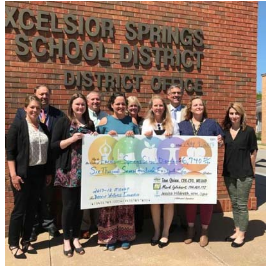
The Excelsior Springs School District Wellness committee accepts a $6,740 check from Cigna for their wellness efforts.

This has been a huge success due to the excellent leadership in our MEUHP Districts. The incentive money is $20 per insured employee and retiree provided the district meets four specific criteria. These include a superintendent survey, wellness presentation and meeting participation requirements for screenings and Health Risk Assessments.