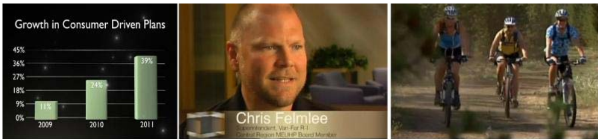
MEUHP - Consumer Driven Health Plans & Health Savings Accounts

MEUHP member districts have been on the forefront of implementing Consumer Driven Health Plans and Health Savings Accounts to help put consumers in charge of controlling health care costs. In this video you'll hear first hand the success stories from MEUHP Board Members, Superintendents and FTJ representatives who educate, encourage healthy lifestyle changes and empower your staff with smart plan choices.