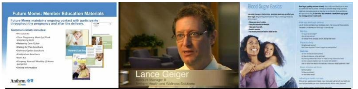
MEUHP Member Services - Anthem 360 programs available through the MEUHP.