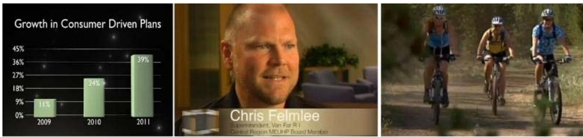
MEUHP - Consumer Driven Health Plans & Health Savings Accounts

MEUHP member districts have been on the forefront of implementing Consumer Driven Health Plans and Health Savings Accounts to help put consumers in charge of controlling health care costs. In this video you'll hear first hand the success stories from MEUHP Board Members, Superintendents and FTJ representatives who educate, encourage healthy lifestyle changes and empower your staff with smart plan choices.