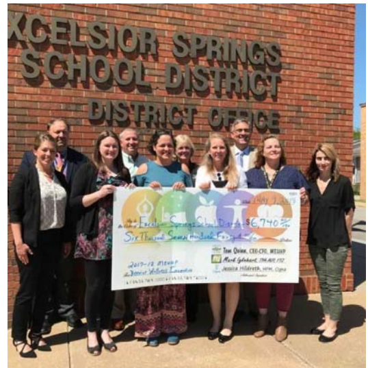
The Excelsior Springs School District Wellness committee accepts a $6,740 check from Cigna for their wellness efforts.

This has been a huge success due to the excellent leadership in our MEUHP Districts. The incentive money is $20 per insured employee and retiree provided the district meets four specific criteria. These include a superintendent survey, wellness presentation and meeting participation requirements for screenings and Health Risk Assessments.